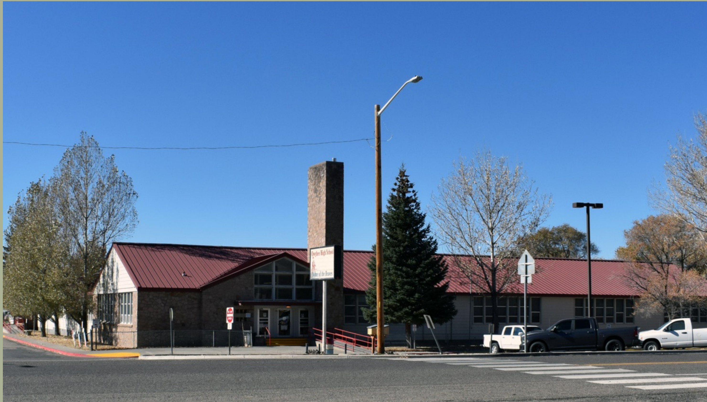
OWYHEE COMBINED SCHOOL